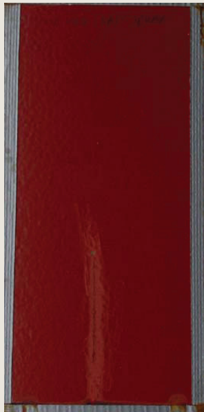
Ancamide 221X70 Field 10 Scribe 10