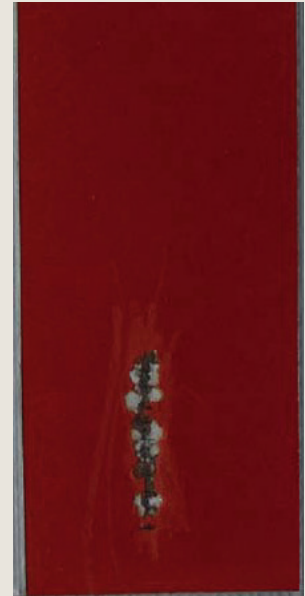
Ancamide 221X70 Field 10 Scribe 6