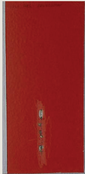
Ancamide 221X70 Field 10 Scribe 7